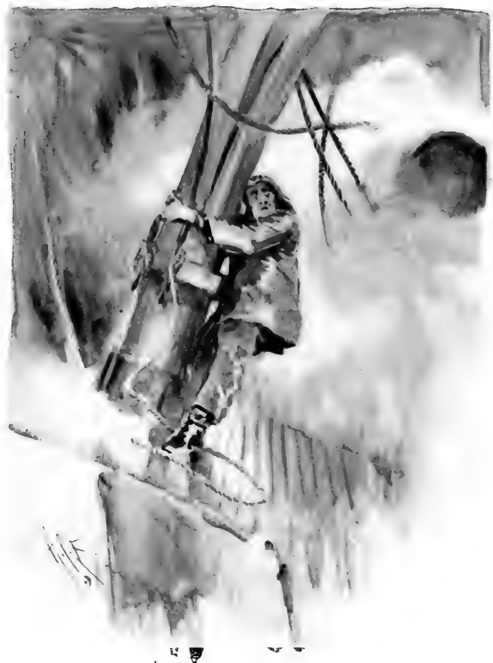
"SEE! TO THE BREAKING MAST THE SAILOR CLINGS."—Page 189.